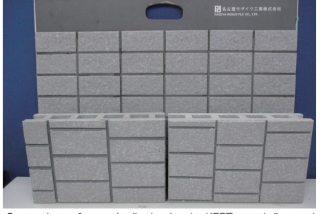
Comparison of ceramic tiles(top)and a KEPT sample(bottom)