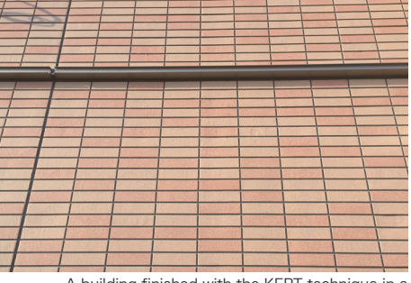
A building finished with the KEPT technique in a two-color mosaic tile pattern